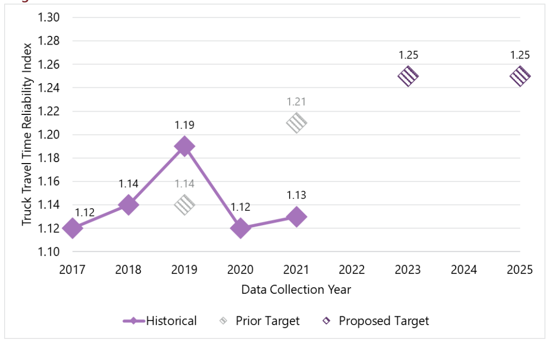
Figure 2: Interstate truck travel time reliability – historical condition, prior targets, and proposed targets